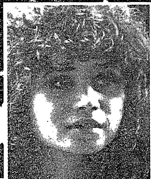
Marlon Brando and Maria Schneider in "Last Tango in Paris."