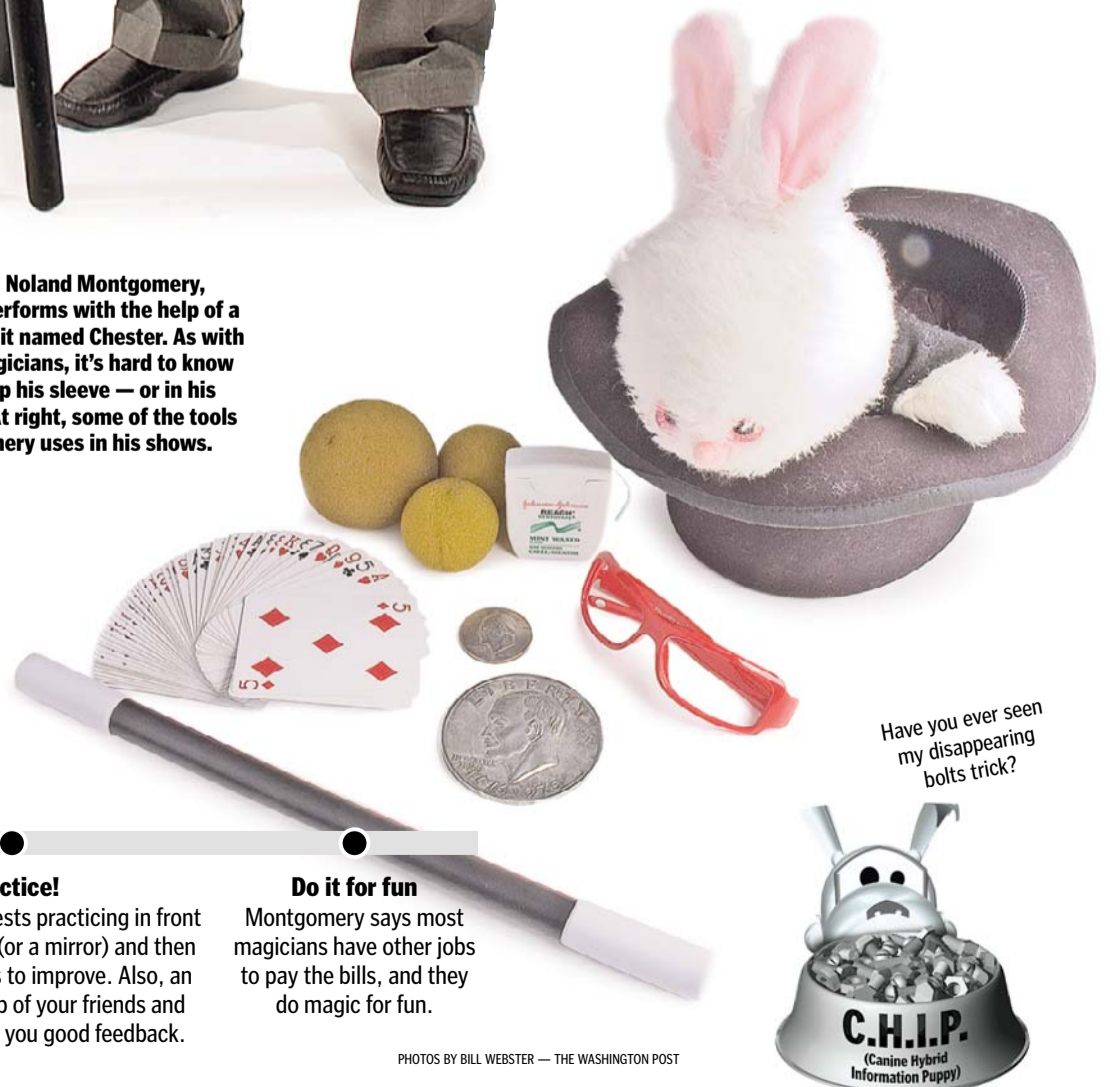
Have you ever seen my disappearing bolts trick?