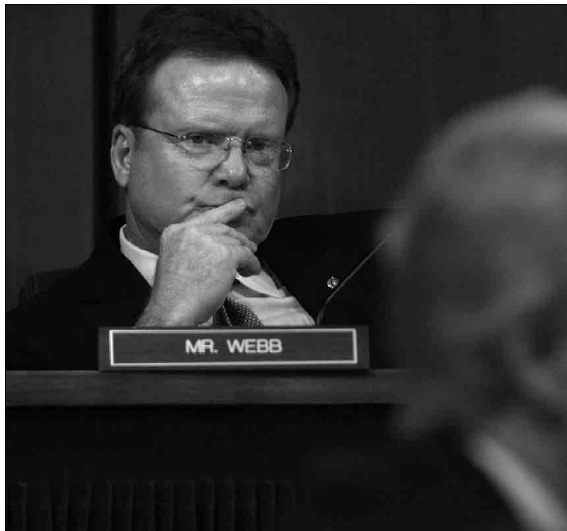
Sen. James Webb (D-Va.), shown at a hearing last week, proposes extending home stays for combat troops.