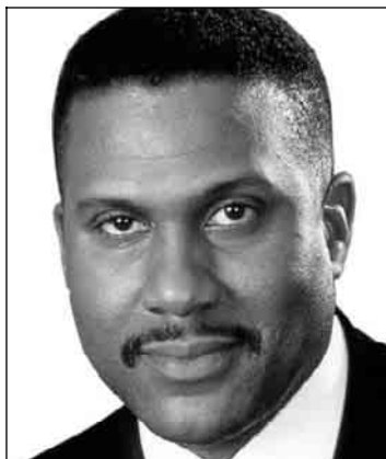
Tavis Smiley, who will host a debate in Baltimore, says GOP candidates have been ignoring minority voters.

Several Republicans have so far declined to participate in a forum sponsored by the Web site YouTube that would be broadcast on CNN. Earlier this week, the top contend-