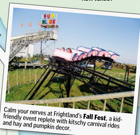
Calm your nerves at Frightland's Fall Fest , a kid-friendly event replete with kitschy carnival rides and hay and pumpkin decor.

Linger long on the Old Scott Run Bridge and you may hear the ghost of Jacob, who, as the story goes, is a drowned former slave who plays the fiddle.