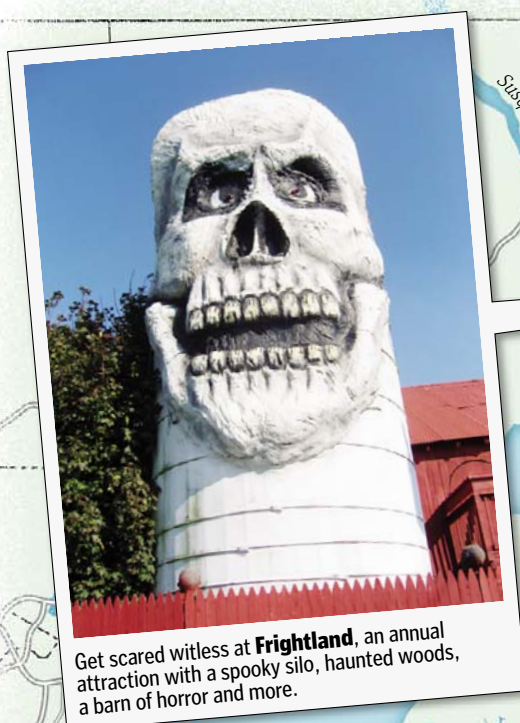
Get scared witless at Frightland , an annual attraction with a spooky silo, haunted woods, a barn of horror and more.

A long-deceased relative of the Finneys is said to toss things about on the third floor of the 18th-century David Finney Inn .