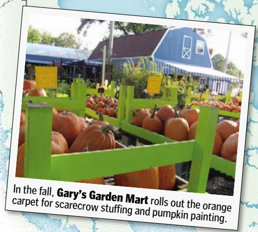
In the fall, Gary's Garden Mart rolls out the orange carpet for scarecrow stuffing and pumpkin painting.

Bush masks are so last October. Update your repertoire at Halloween Adventure , which stocks 10,000 costumes.