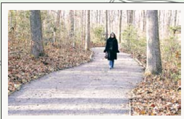
Stroll along a wooded trail at the Walker Nature Education Center .