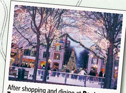
After shopping and dining at Reston Town Center , it's time to take to the ice.