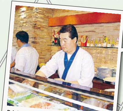
Brighten your day with the "rainbow roll" sushi at Ariake .

Get your tickets now for a talk by "High Fidelity" author Nick Hornby at the Center Stage on March 21.